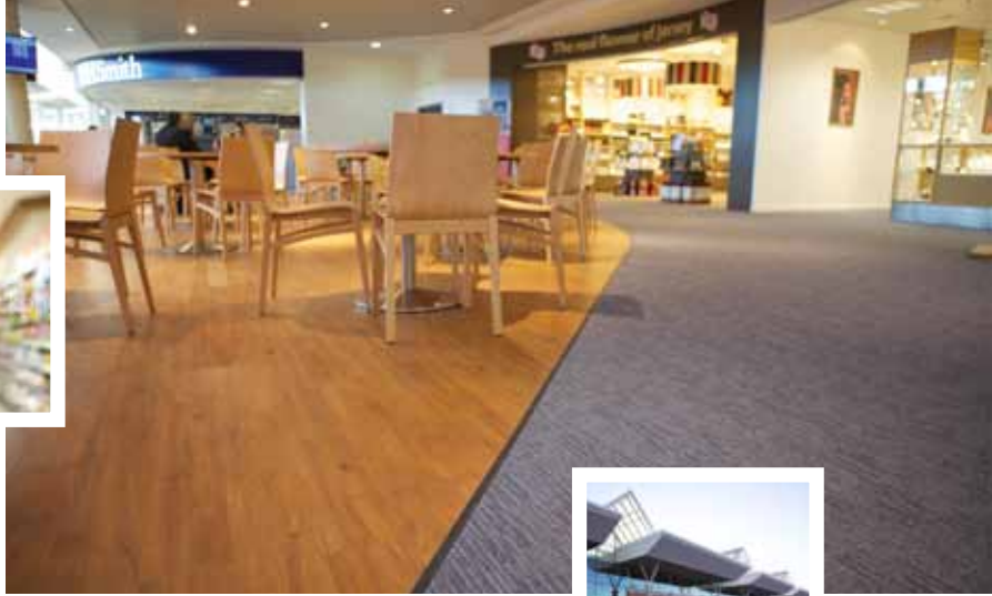
Jersey Airport - duty free shopping area