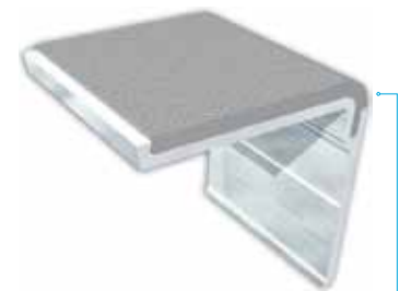
XT range with extended insert design