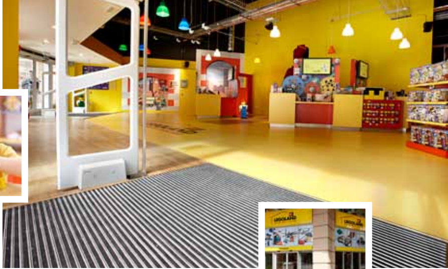
Legoland Discovery Centre - Trafford Centre